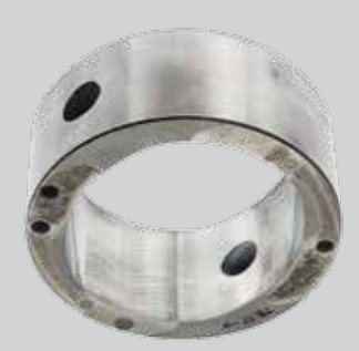
VANE PUMP CAM RING