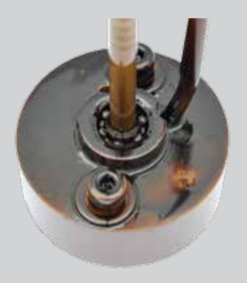
LEADING CONVENTIONAL HYDRAULIC FLUID (ISO 46)