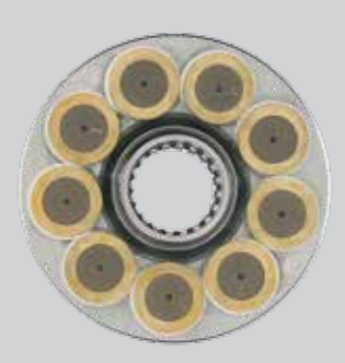
YELLOW METAL PISTON SHOES