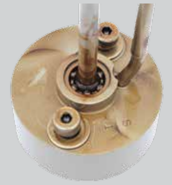
AMSOIL MULTI-VISCOSITY SYNTHETIC HYDRAULIC OIL (ISO 46)

Strong wear protection is equally critical to long hydraulic system life. After 608 hours of strenuous hydraulic pump testing, the piston shoes demonstrated only moderate polishing and trace, random scratches, proving AMSOIL Multi-Viscosity Synthetic Hydraulic Oil excels at protecting yellow metals. The vane pump cam ring exhibited only light polishing and trace scratching, further confirming the excellent wear protection provided by the oil.