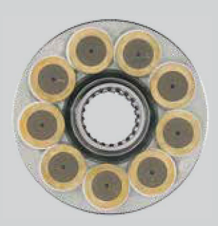
YELLOW METAL PISTON SHOES