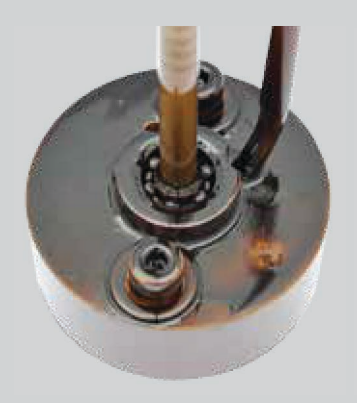
LEADING CONVENTIONAL HYDRAULIC FLUID (ISO 46)