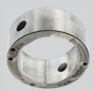
VANE PUMP CAM RING