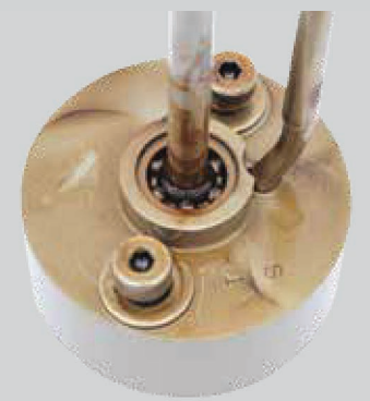
AMSOIL MULTI-VISCOSITY SYNTHETIC HYDRAULIC OIL (ISO 46)

Strong wear protection is equally critical to long hydraulic system life. After 608 hours of strenuous hydraulic pump testing, the piston shoes demonstrated only moderate polishing and trace, random scratches, proving AMSOIL Multi-Viscosity Synthetic Hydraulic Oil excels at protecting yellow metals. The vane pump cam ring exhibited only light polishing and trace scratching, further confirming the excellent wear protection provided by the oil.