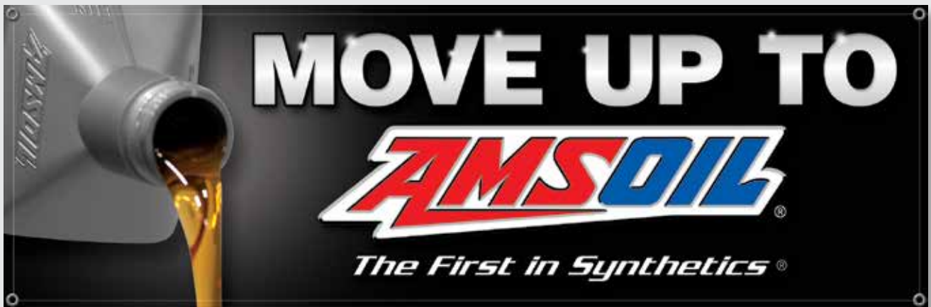
2' x 6' Banner (G3214)

For comprehensive ordering, shipping and sales tax information, see the Retail Account Ordering Information Sheet (G2603).