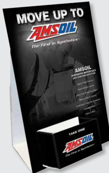
POP Literature Display (G3405)