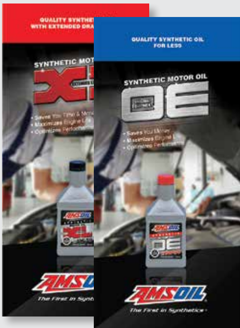
XL & OE Brochures (G3406 & G3407)